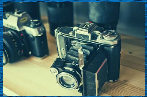
PHOTO CONTEST WINNERS