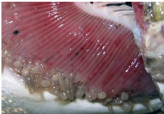
Salmincola copepods on gills of Chinook salmon.