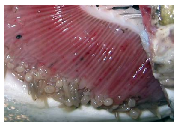
Salmincola copepods on gills of Chinook salmon.