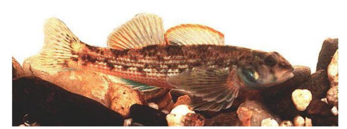
Figure 1. A male turquoise darter

http://people.clemson.edu/~jwfoltz/Research/reports/darter/thesis/Irwin.pdf). Every riffle in the Clemson Forest has turquoise darters residing on them. Recent stockings have been made for the purpose of additional genetic diversity.