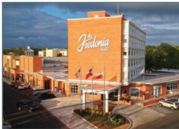
The 2024 annual meeting of the Texas Chapter of the American Fisheries Society will be held at the Fredonia Hotel in Nacogdoches, TX, from February 22-24th, 2024.